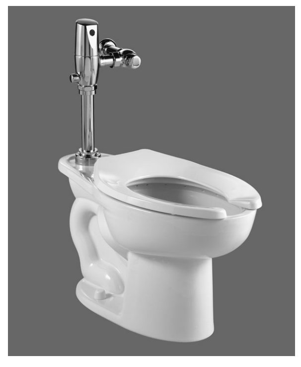
SEE REVERSE FOR ROUGHING-IN DIMENSIONS