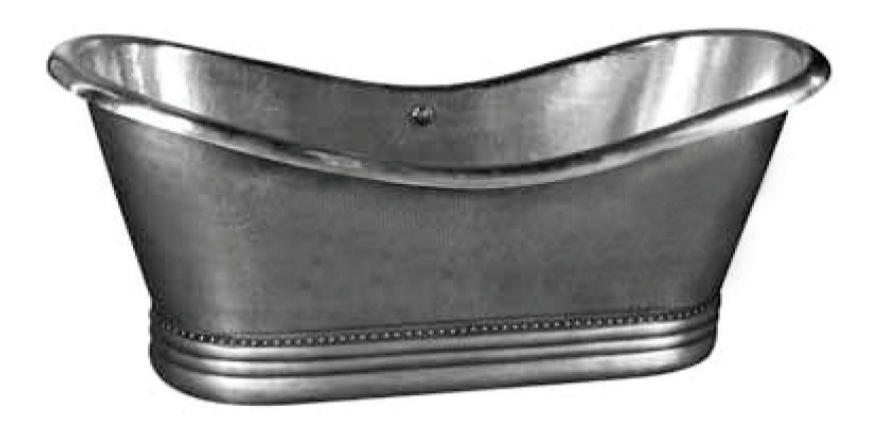
Note: This model requires a remote blower location. Please refer to the owners manual for detailed installation instructions.

SOAKER MODEL #AI42COPNIKTO AIR BATH MODEL #AI42AIRCOPNIK