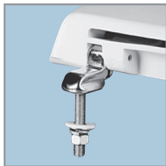
300 SERIES STAINLESS STEEL SELF-SUSTAINING HINGES (1900SS)