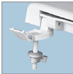
NON-CORROSIVE BOLTS AND WING NUTS (1900)