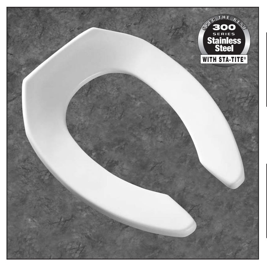
STA-TITE<sup>®</sup>, COMMERCIAL FASTENING SYSTEM™, ONE-PIECE INTEGRATED NUT AND WASHER