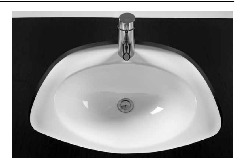
Model 226-1 (Less faucet, drain assembly and supply)