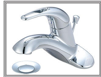
#3LG170 SHOWN * ADA