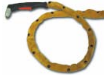
Leather Leads Cover Cat. No. 9-1260