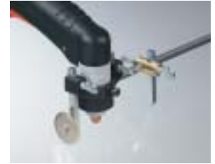
Cutting Guide Kit Cat. No. 7-7501