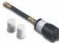
Single Stage Air Filter Cat. No. 7-7507