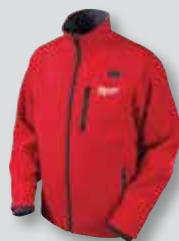
Red (2340, 2341)