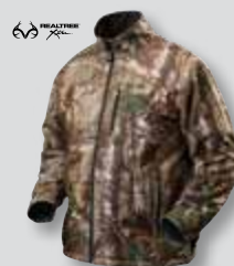
Realtree Xtra® Camouflage (2342, 2343)