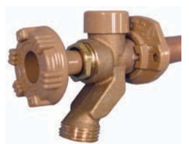
Model 22 - Produced before May 2008.