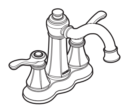
VESTIGE™ Two Handle Centerset Lavatory Faucet