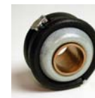
BEARING BALL & CUSHION