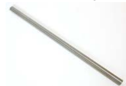
SHAFT WITH FLAT FOR SET SCREW