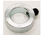
ECONOMY HOLLOW STEEL COLLAR