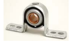
HIGH RISE PILLOW BLOCK BEARING