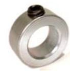
STANDARD SOLID STEEL COLLAR