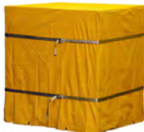
E-Z STRAP™ COVER TIE DOWNS