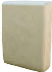
NARROW PROFILE WINDOW