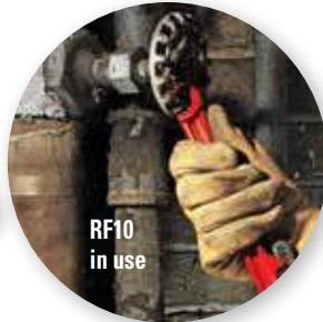
RF10 in use

Keep this lightweight 2-in-1 wrench handy all day!