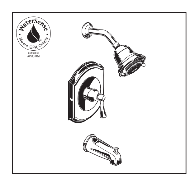
T415.502 Bath/Shower Trim Shown