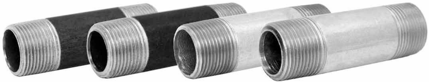
FIG. 339: Standard Black Schedule 40