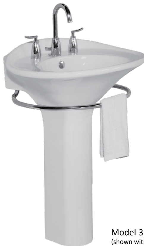
Model 320-8 (shown with optional towel bar)