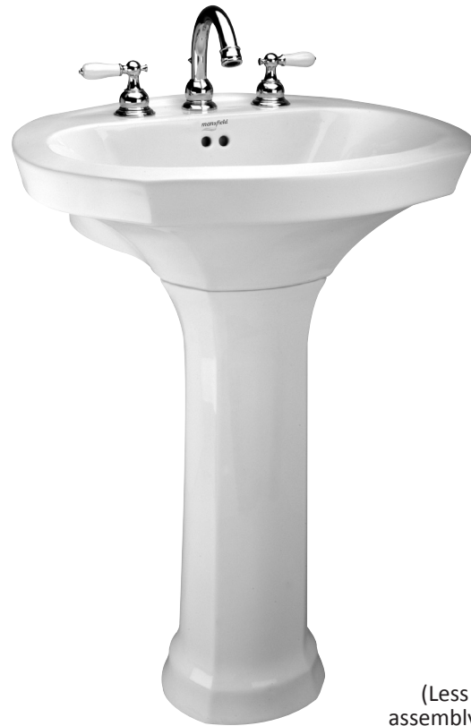
Model 335 (Less faucet, drain assembly and supply)