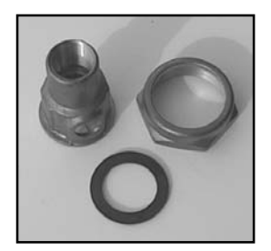
Bronze Half Union Isolation Valve (Threaded) 1/2" = Part #519850 3/4" = #519852

Bronze Half Union (Threaded) 3/4" = Part #529912