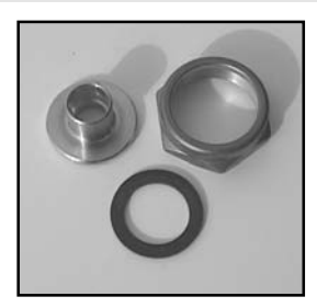
Bronze Half Union (Sweat) 1/2" = Part #529913 3/4" = Part #529911