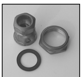
Bronze Union Isolation Valve (Compression) 3/4" = Part #519851

For Stainless Steel Body, Union Mount Pumps UP15-18SU • UP15-42SU • UP25-64SU