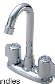
S-245 with std LCT handles