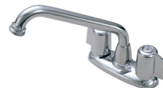
S-249 with std LCT handles