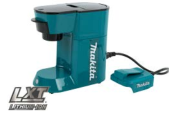
DCM500Z Tool only - battery and charger not included