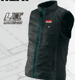
Vest only - battery and charger not included