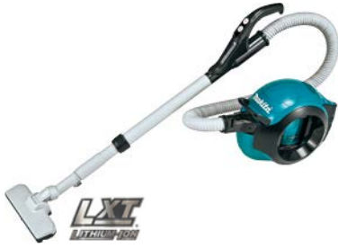
DCL500Z Tool only - battery and charger not included