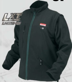
Jacket only - battery and charger not included