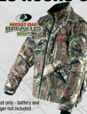
Jacket only - battery and charger not included