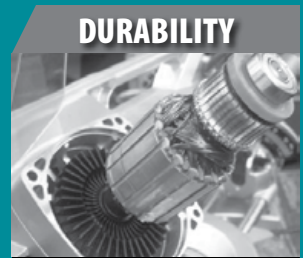
Powerful 15 AMP direct drive motor requires less maintenance than belt driven saws