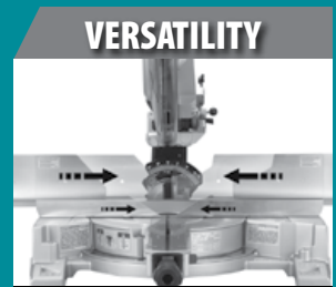
5-1/2" tall fence system features upper and lower fence adjustments for more precise cuts (LS1216L)