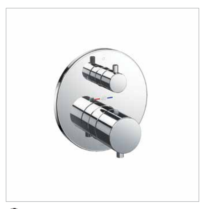
I Safety Thermo™ (SMA)

Product shall be TOTO Model TBV01408U#___. Product shall require TBN01001U MiniUnit (sold separately). Product shall be a temperarture control valve and trim with anti-scold safety stop. Product shall be ASSE certified.