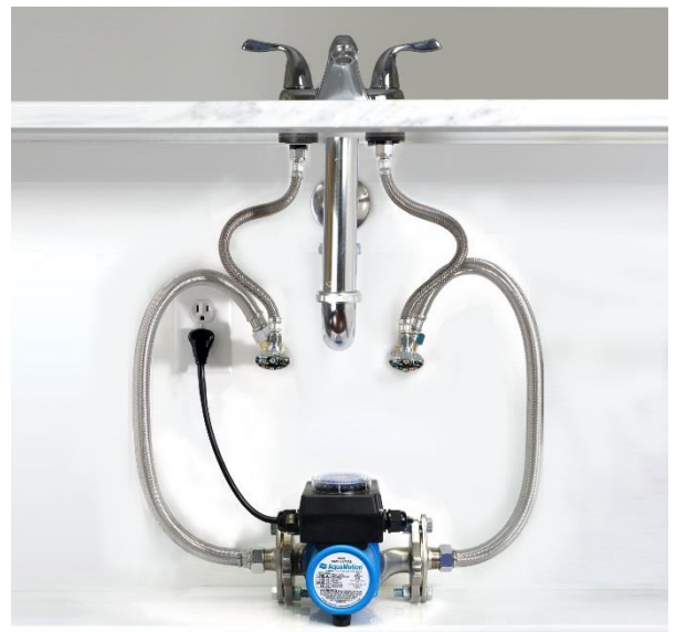
Installation Diagram with Timer