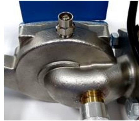
(Figure 3) Air Lock Relief Valve