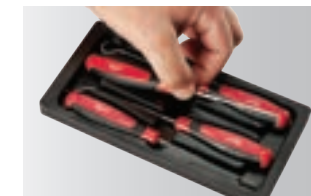
Easy Access Storage Tray