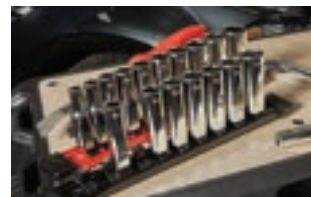
Includes Storage Rail