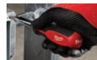
Comfortable Tri-Lobe Handle