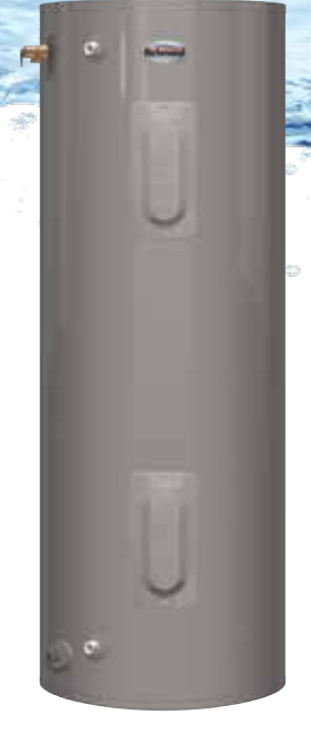
Essential for Manufactured Housing 30 and 40-Gallon Capacities 240 Volt AC/Single Phase

Units meet or exceed ANSI requirements and have been tested according to D.O.E. procedures. Units meet or exceed the energy efficiency requirements of NAECA, ASHRAE standard 90, ICC Code and all state energy efficiency performance criteria.