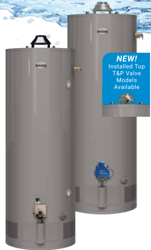
**48-gallon tall model with side water connections

Units meet or exceed ANSI requirements and have been tested according to D.O.E. procedures. Units meet or exceed the energy efficiency requirements of NAECA, ASHRAE standard 90, ICC Code and all state energy efficiency performance criteria.