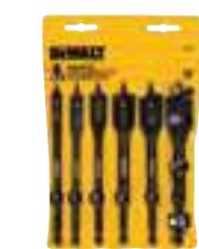
Heavy-Duty Spade Bit Set