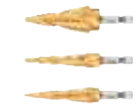
Step Drill Bit Set