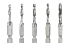
Combination Tap & Drill Bit Sets