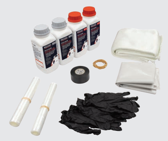
Catalog No: 74718