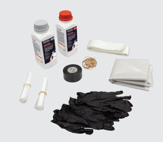
Catalog No: 74698