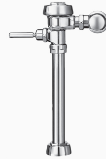
Variation Not Shown: Trap Primer