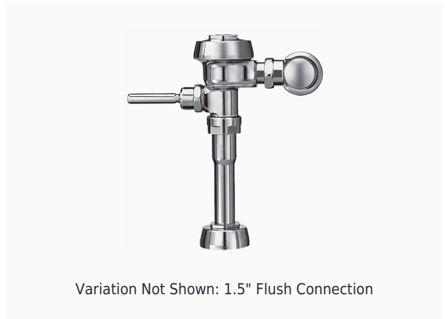
Variation Not Shown: 1.5" Flush Connection