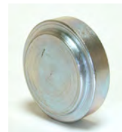
BLOWER SHAFT PLUG