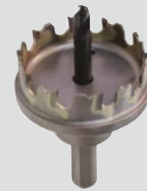
Industrial Carbide-Tipped Hole Saws Available See pg. 107

Special alloy tip for longer cutting life in stainless steel