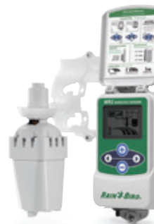
WR2-RFC Wireless Rain/ Freeze Sensor

The ESP-LXD supports up to 4 weather sensors, one wired into the ESPLXD-M50 Base Module and up to three additional on the two-wire path interfaced with SD-211 sensor decoders. Supported Rain Bird sensors include the RSD wired rain sensor, the WR2-RC wireless rain sensor, the WR2-RFC wireless rain/freeze sensor and the ANEMOMETER wind sensor (the Rain Bird 3002 Pulse Transmitter is required for use of the ANEMOMETER). Soil moisture sensors that provide a normally closed switch interface are also supported.