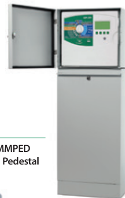
LXMMPED Metal Pedestal