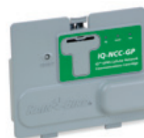
NCC-GP Communication Cartridge