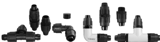
Twist Lock Fittings - 800 Series (For use on ¾" QF Header)